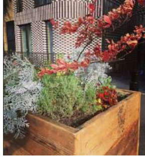
Gaywood Road residents' planter