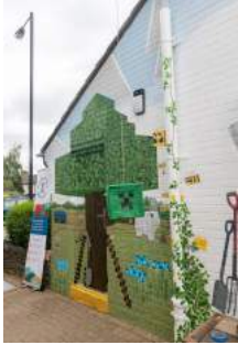
Tool Library Mural