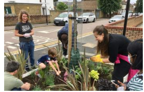
Erskine Road Planters

Many local residents have used this year to bring colour and life to a variety of outdoor spaces and used WMBL funding to green up streets, housing blocks, community centres, schools and libraries for all to enjoy. Here's just a few installations that will continue to brighten up the area in 2022.