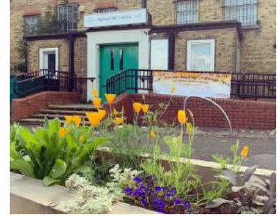
Planters outside Higham Hill Library