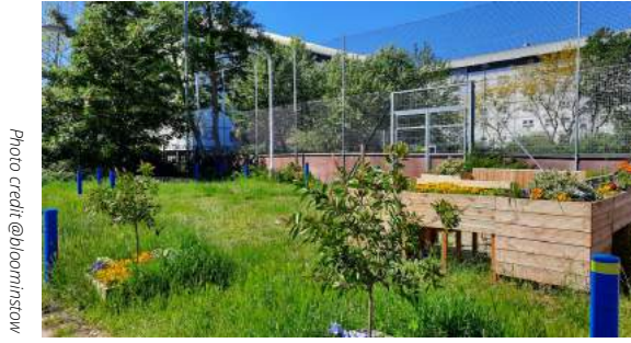
The Living Bench at Priory Court Community Centre