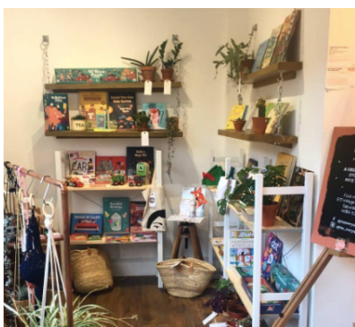
(The pop up shop)

We have an exciting calendar of events for the upcoming weeks and into next year, including a silver ring workshop, hosted by our current pop up tenant Rie Tenabe, a free interactive workshop for single parents hosted by Libby Liburd, a dress making workshop and a Tunisian crochet workshop. Looking forward to 2018, we'll be hosting beginners French classes and we're hoping to have a mix of other language classes such as Mandarin, and our very popular life drawing class will be making a highly anticipated return.