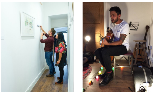
(The exhibition space and a live performance. Just two of the many fabulous things going on at Locus)