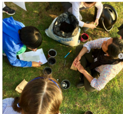
Green Grants have funded projects from the Living Bench at Priory Court through to community planting sessions