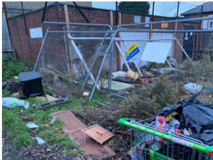
William Morris Close Garages – 2022