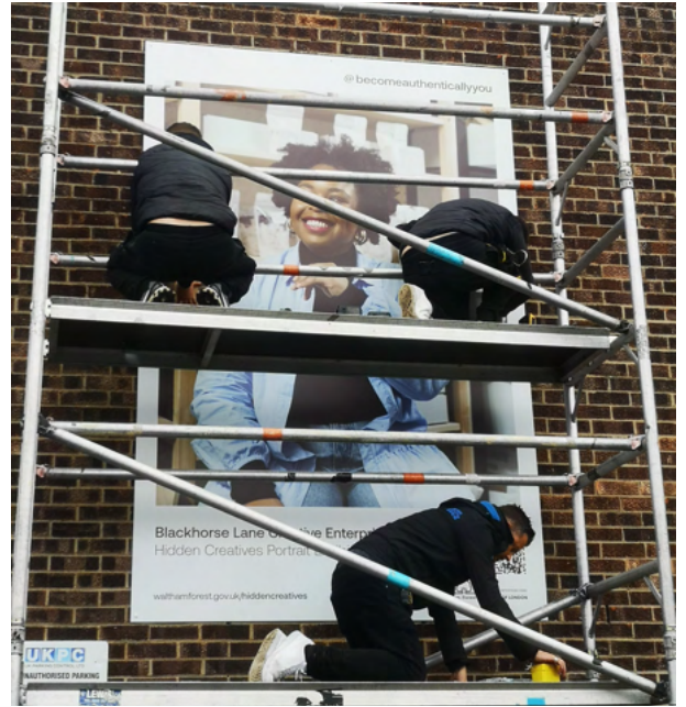
How many portraits can you spot?

Find the portraits inside Blackhorse Road station, on hoardings opposite the station, on the walls of Big Penny Social, on the old Exotic Veneers building and outside Hackney Brewery.