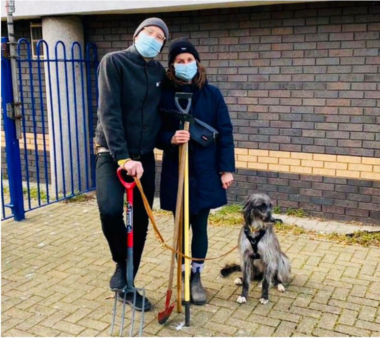
Get ready for growing now by borrowing tools