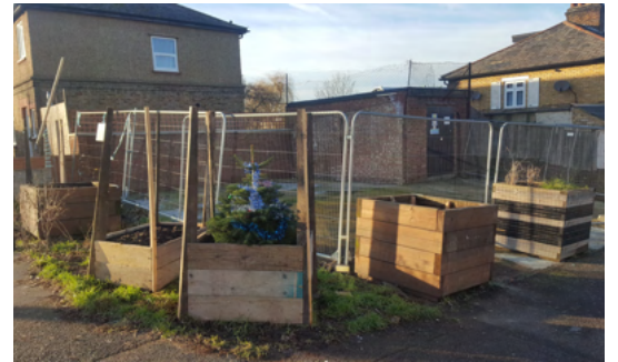
...and currently a meanwhile space in 2023