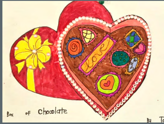
Art By Tahir Khan