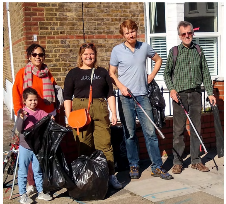
Everyone is welcome to join the pickers

This group is open to everyone who wishes to join the next litter picking event for residents. Email admin@wmrassociation.org with suggestions and for a link to join the WhatsApp group.