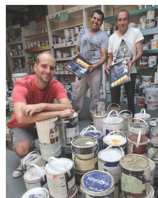
(Forest Recycling Project)

Many of us when we hear the word business might immediately think it's just about making money, creating jobs or contributing to the national economy. These are certainly important factors but at Big Local we are interested in the types of business that can also change the world for the better at the same time. If you've ever bought a copy of The Big Issue, shopped at the Co-op or bought paint from Forest Recycling Project then you will have been supporting a business with a social heart that aims to tackle social problems, improve people's life chances and support communities. Crucially these businesses are not-for-profit and put all of the money they make back into the business that supports their social objectives. These types of business are known as social enterprises and the people who create them are called social entrepreneurs.