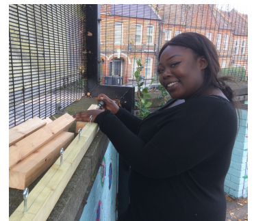
(Community led improvements on Wolsey Avenue (left) and at Greenleaf Primary School)

The outdoor spaces plan will be there for everyone to share in and get involved with. The more people taking part in it, the more we will be able to help make the area look and feel better for everyone. We are keen to speak to anyone interested in getting involved whether they are an individual, part of a community group or have expertise in the field to share. Come and see us on the 20th March at our Get Together event or contact us for more information!